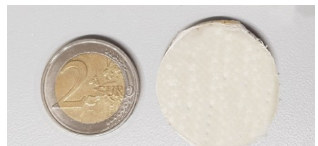
Sample from core drilling

For further information, please refer to our handout "Testing of sewer lateral liners".