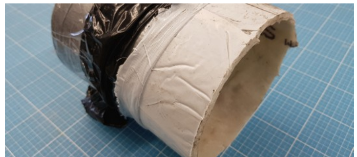
For small nominal diameters a pipe section can be taken